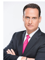
JOSÉ DÍAZ -BALART Television News Anchor

Conference Registration Urban Schools Resource Room/Internet Cafe General Session A: Breakfast and Address from Chair of the Board CONCURRENT SESSIONS ON BEST PRACTICES General Session B: Lunch and Speaker: JOSÉ DÍAZ -BALART CONCURRENT SESSIONS ON BEST PRACTICES Executive Committee Meeting Cocktail Reception 27th Annual Green-Garner Banquet ( Semi Formal Evening Attire ) Hospitality Suite- Karaoke Night