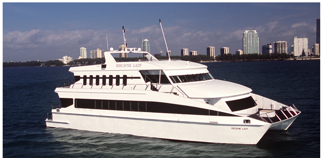
Biscayne Lady Yacht